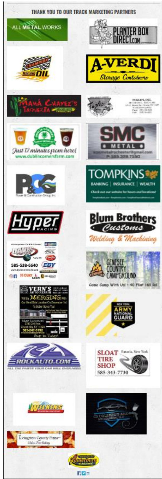
Screenshot of our 2022 Marketing Partner acknowledgements on LRSpeedway.com

In recent years, we have begun to use the page to handle the sale of things like banquet tickets, pre-registration for larger events, and most recently Limerock Speedway Apparel. As we work to streamline these processes, we are increasing traffic to our website as well as exposure for your business.