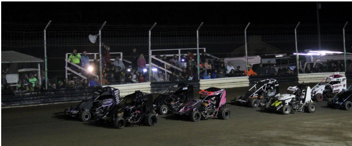
Parade Lap on the Back Stretch – September 25, 2022

Even in the offseason - spectators and competitors alike are actively interacting with us on social media expressing their enthusiasm for the coming season. You can check out our Facebook page at: https://www.facebook.com/LimerockSpeedway/ I encourage you to like and follow us on Facebook. We currently have 6,327 followers of our Facebook page, with an average reach of 19,563 and these numbers continue to grow. Our fans are highly engaged and support the local businesses that support us. We expect that our partnership in 2024 will help to bring new customers to your business.